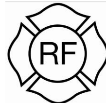
Light-Frame Roofing & Sub-floors